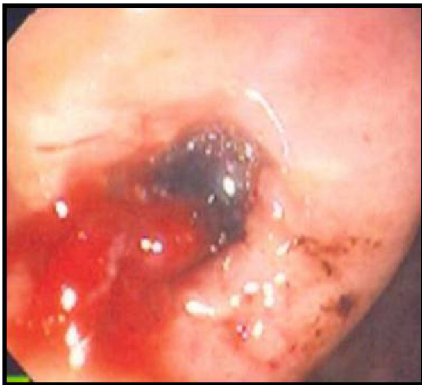
Figure 1 Endoscopic image of a 1×1 cm hemorrhagic gastric ulcer in the antrum with a visible vessel revealed by endoscopy.

Note: Endoscopy is from a 53-year-old woman presenting to the emergency department following two bouts of hematemesis and a melanic stool.